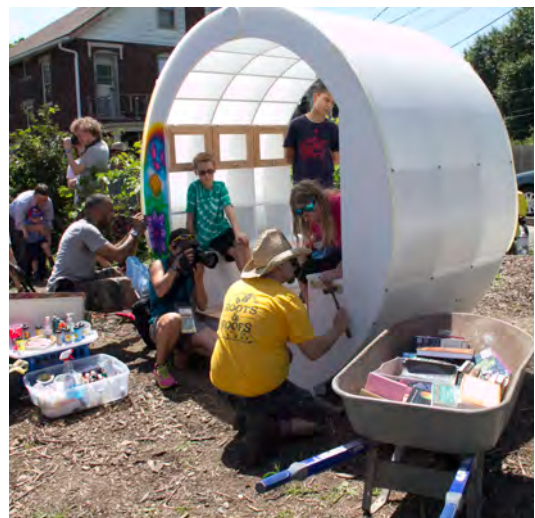
Volunteers and an artist put the finishing touches on the unique Little Free Library at 4 th Street Farms community garden.

Education: Weinland Park Elementary School received high marks for its students achieving more than a year's worth of learning in one school year, but many children start out too far behind. Changing state tests make measuring progress difficult, but the school's visionary principal and experienced teaching staff are committed to a path to meet the school's academic goals. The school has partnered with The Counseling Source to provide families with on-site counseling with a certified mental health and behavioral specialist. The school also partners with three organizations that mentor young people and an organization that offers weekly tutoring for struggling students. WPC supports the school through funding for Godman Guild's ACES in-school and after-school program and for "extras" that affirm the teachers and students, such as costumes for the school's entertaining spring musical with a Wizard of Oz theme, "Ease on Down the Road." Students also have access to a variety of extended learning programs, including College Mentors, chess club and Boy Scouts.