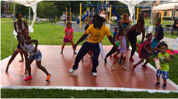
Line dancing at the annual Weinland Park Neighborhood Festival in August 2016.

and have planted some 20,000 bulbs and flowering plants in public areas. 4 th Street Farms introduces children and adults to urban gardening and in June celebrated the installation of unique round, eight-foot-tall Little Free Library for those who want to read among the vegetables, berries and flowers.